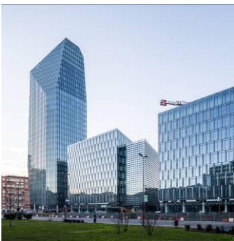
The Diamond KPF

Design by: Pelli Clarke Pelli Architects; Kohn Pedersen Fox; Boeri Studio; + Arch, Arquitectonica; M2P Associati; Inside/Outside.