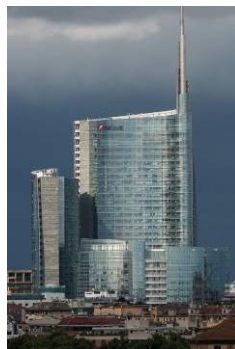
Unicredit Tower Cesar Pelli