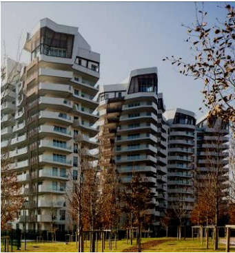
Libeskind complex Daniel Libeskind

Projects by: Zaha Hadid, Arata Isozaki, Daniel Libeskind