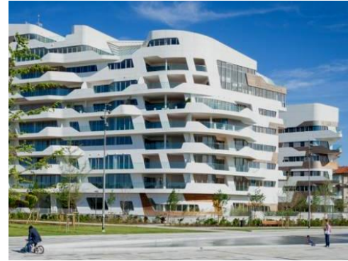
Hadid Complex Zaha Hadid