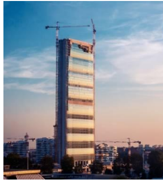
Allianz Tower Arata Isozaki