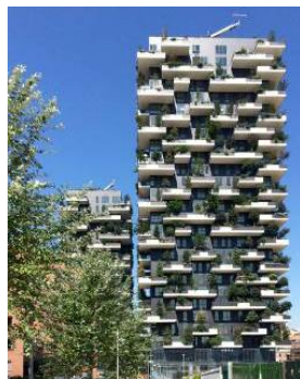
Bosco Verticale Boeri Studio